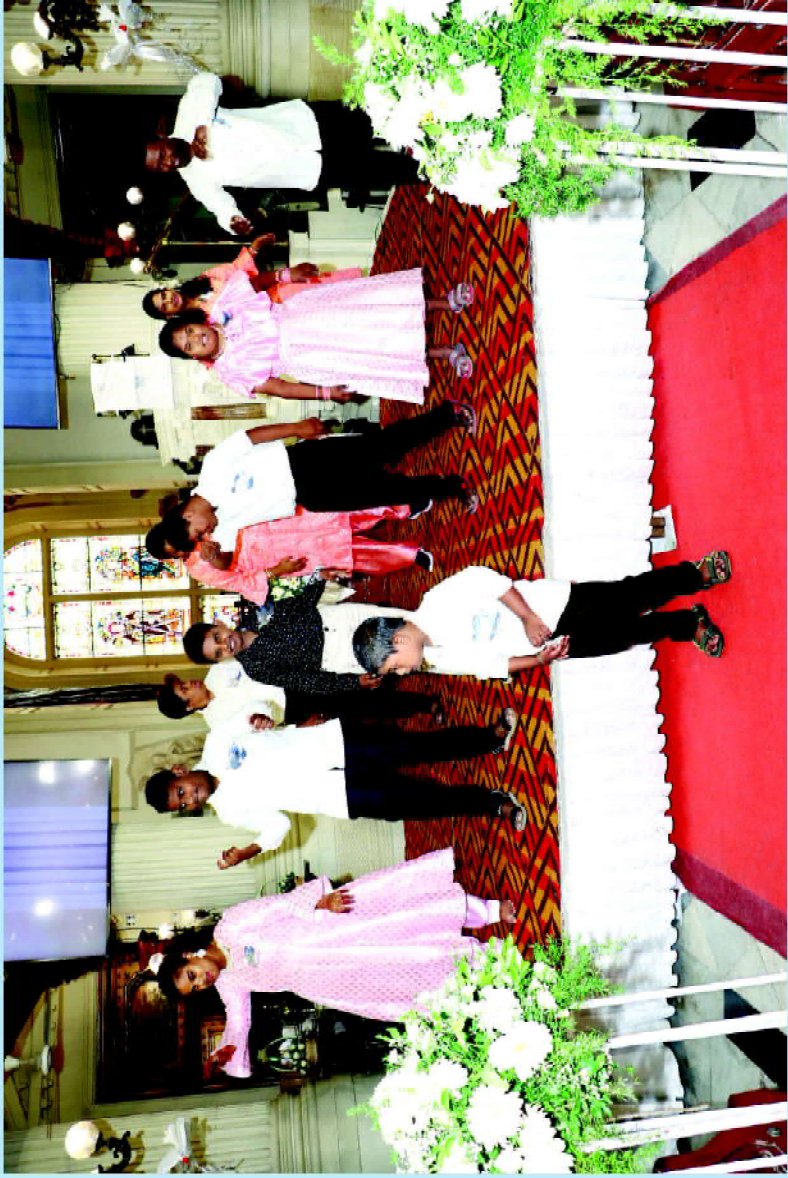
Asha Sunday Programme