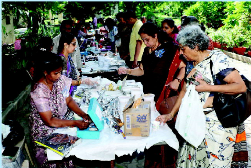
Asha Sunday Sale