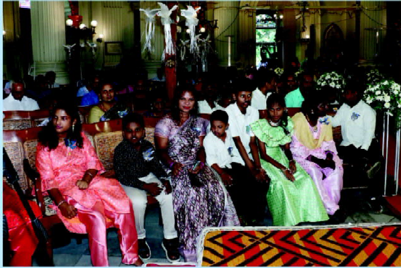
Asha Sunday Participants