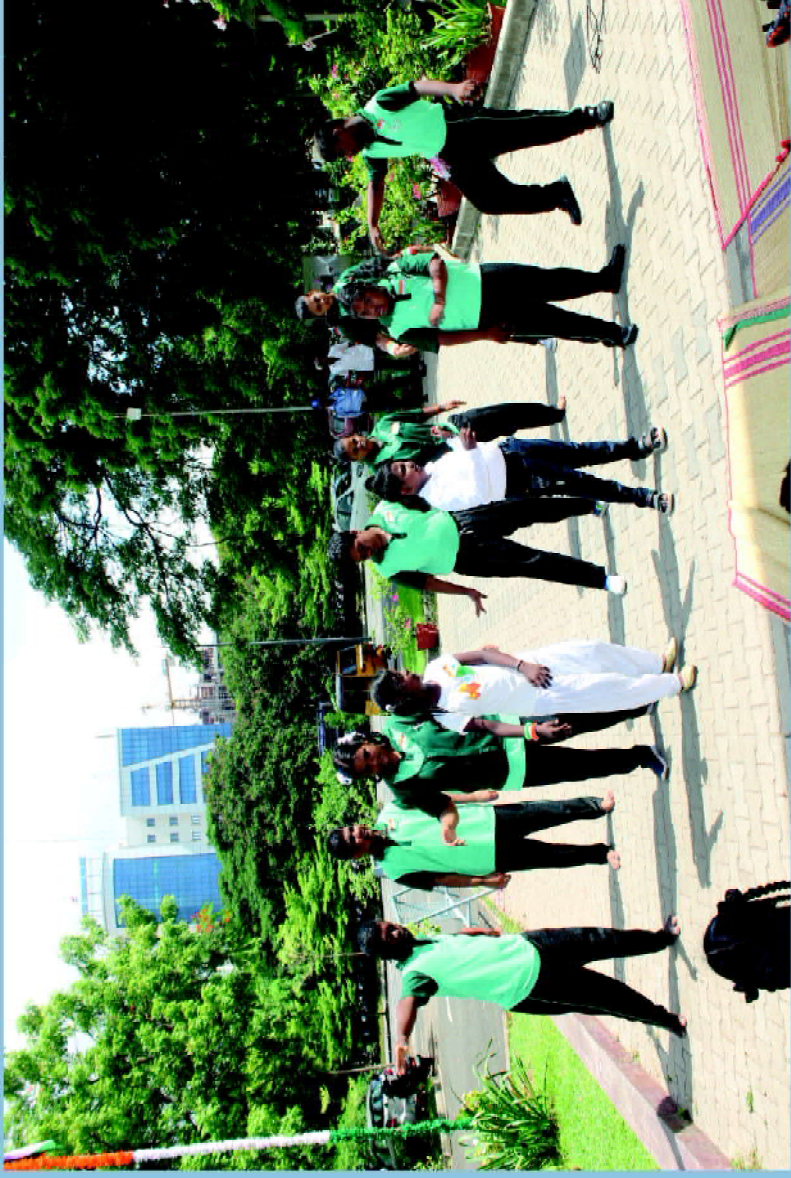
Asha Children on Independence Day Celebration