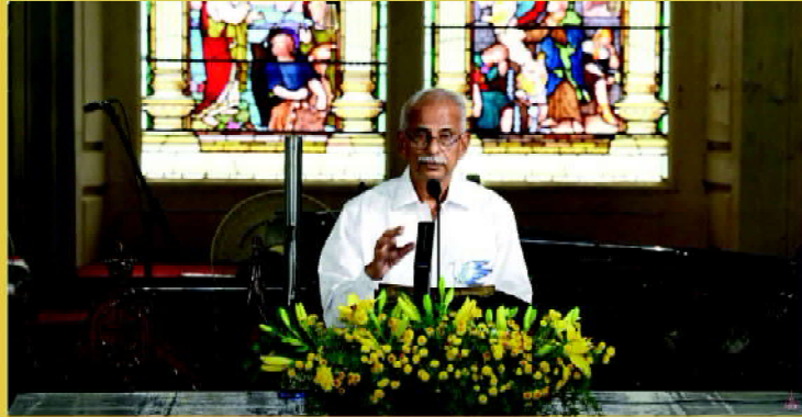
The ASHA Thanksgiving service popularly known as ASHA Sunday