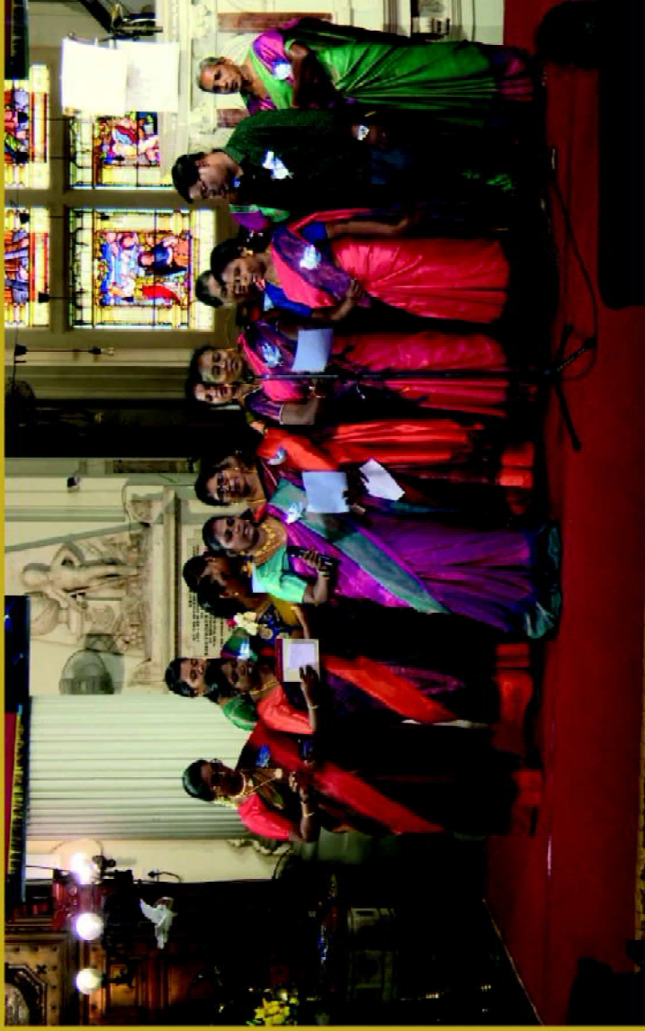
The Staff of ASHA thanking God for his grace