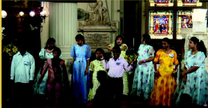
The children of the Egmore ASHA presenting a dance