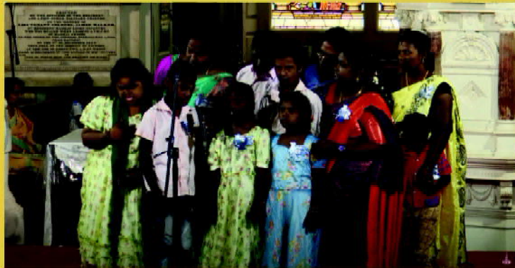
The children of the Thirupalaivanam ASHA centre