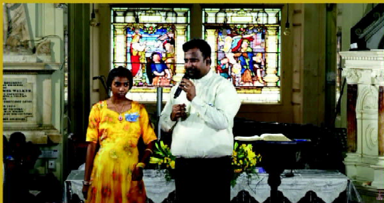
Pastor with Joshua Message on 'Bond beyond blood'