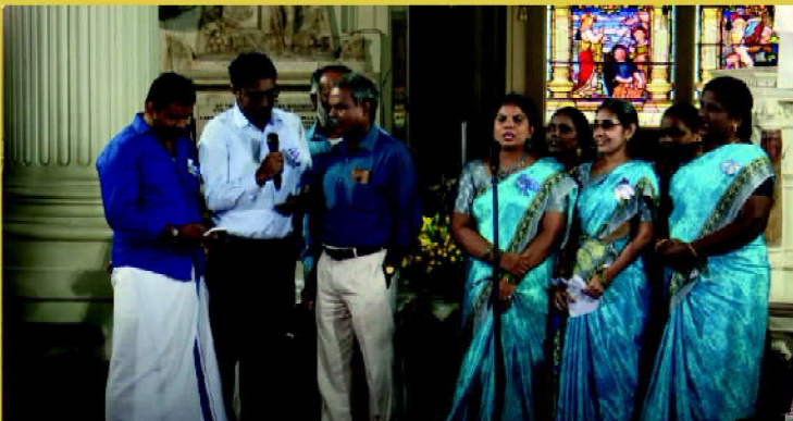
The Parents of Egmore ASHA praising God