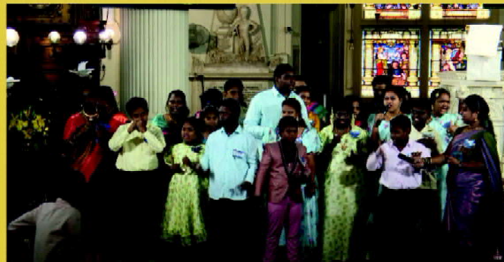
The children of the Egmore ASHA singing.