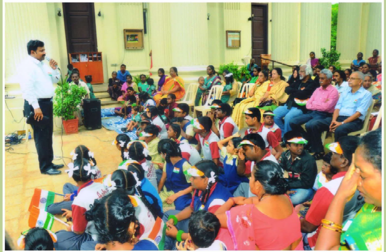
Pastor speaking at the gathering on Independence Day