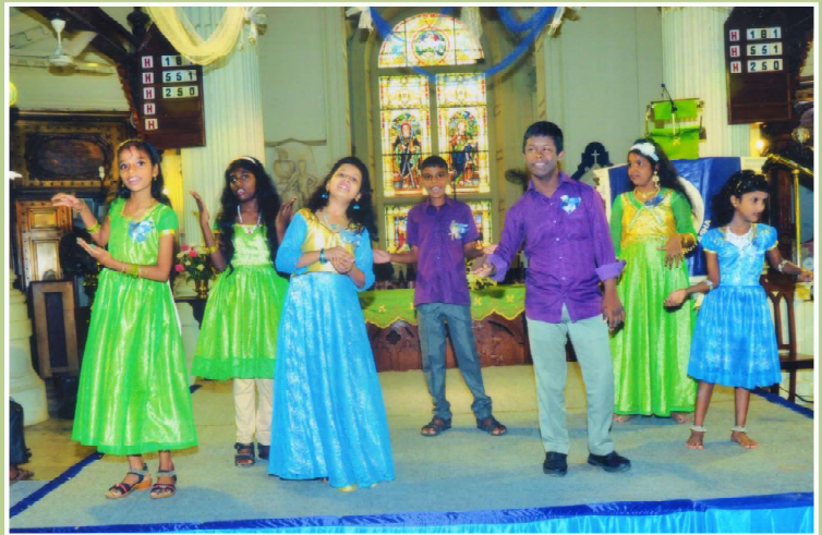
Asha students performing on Asha Sunday (20th August) Children of RMDCC celebrating on Open Day