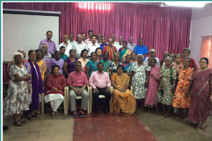
Annual Retreat of the Friendship Club