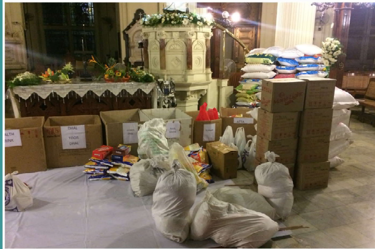
Preparing for Thanksgiving Sunday (10th September)