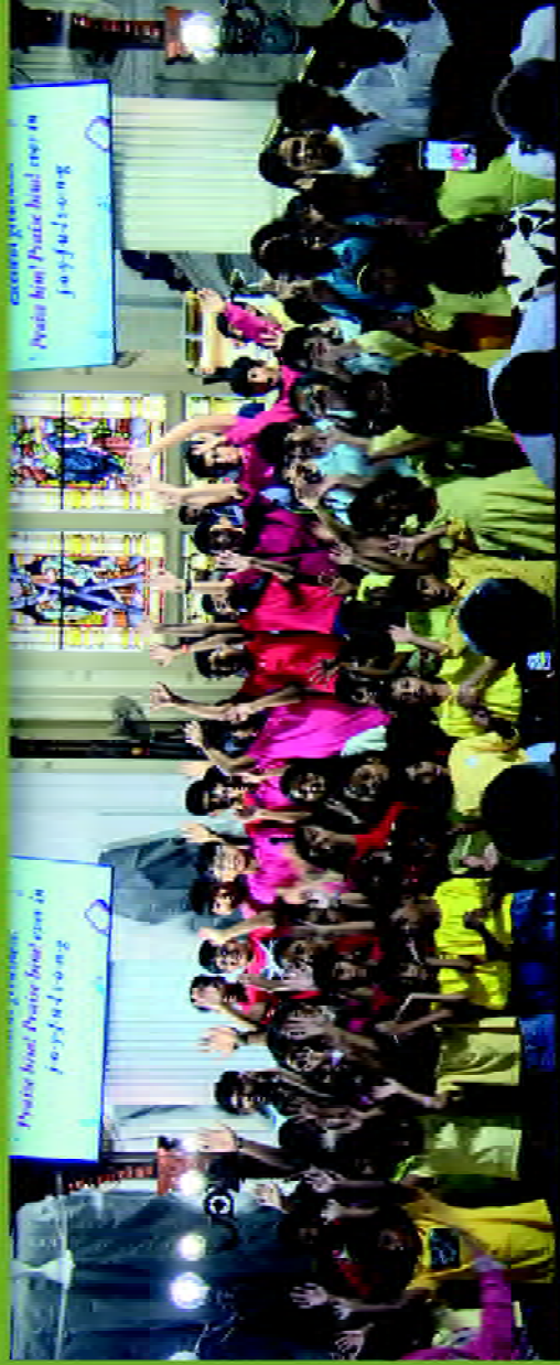
Little voices, big praise.