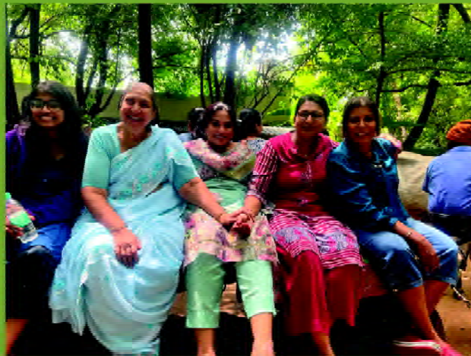
Bullock cart ride