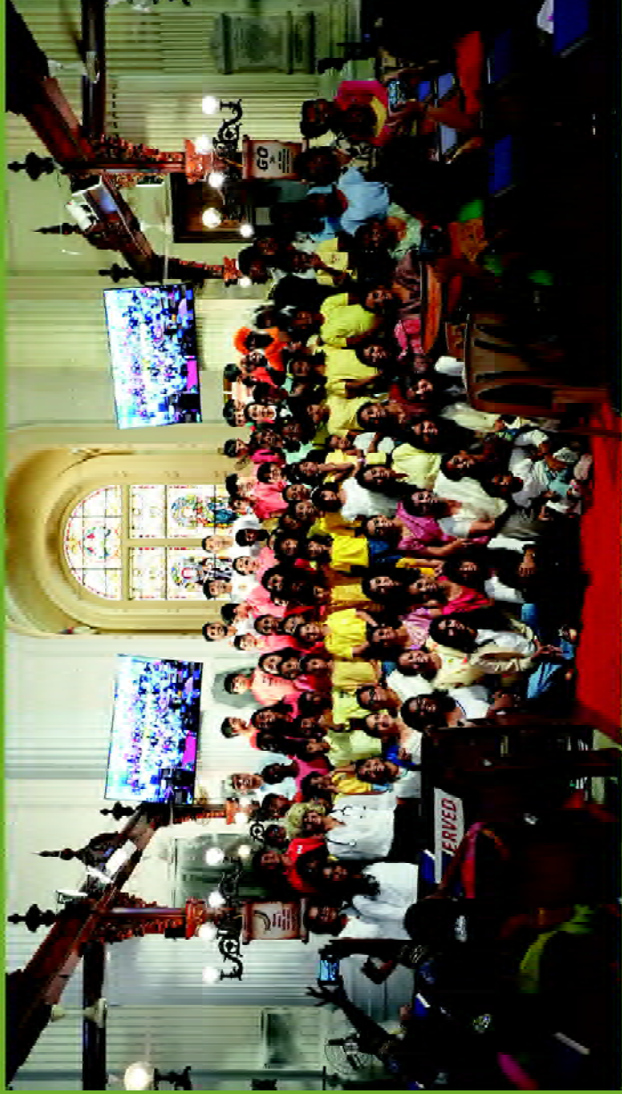
The Kirk Sunday School Family.