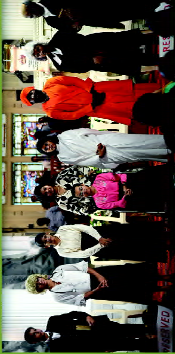
The Great commission - Missionaries Talk show