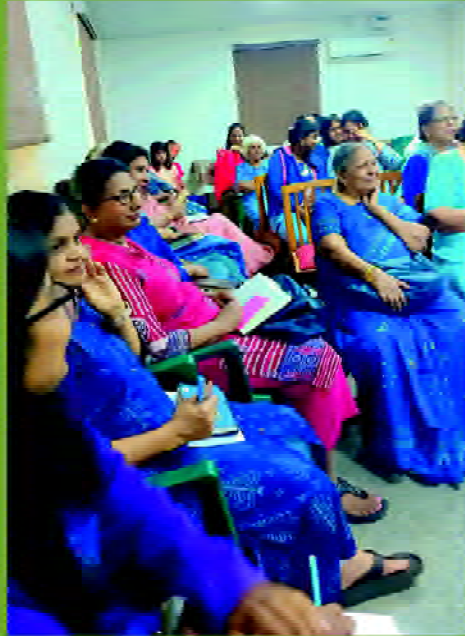
Bible session time