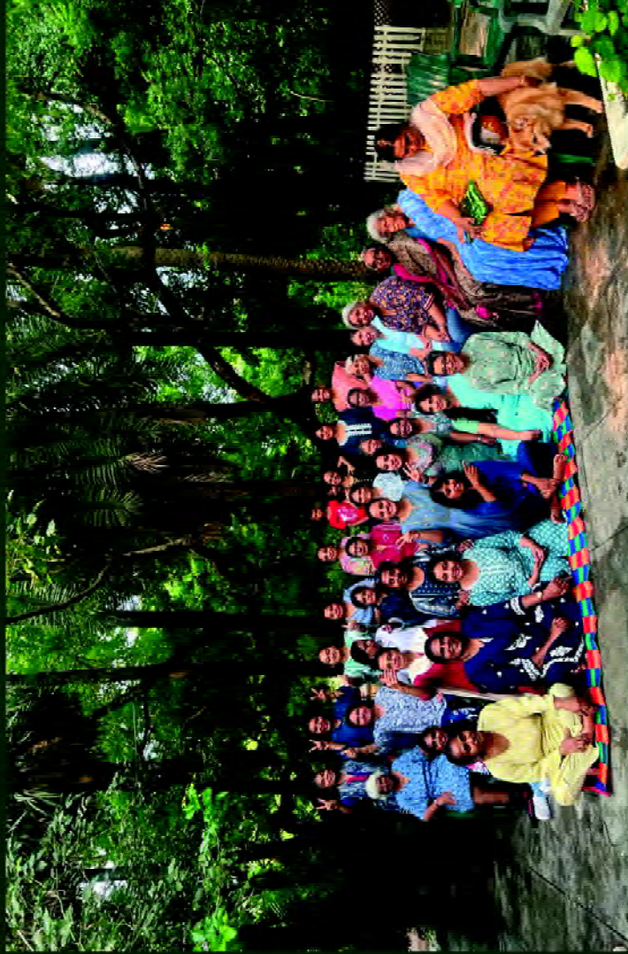
KWF Retreat @ Coromandel Gardens, Sripurumbadur