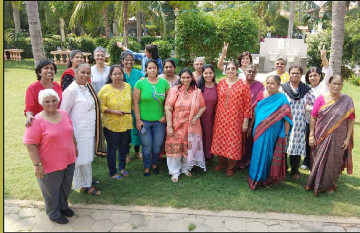
Kirk Women's Fellowship Retreat - October 20th 2018