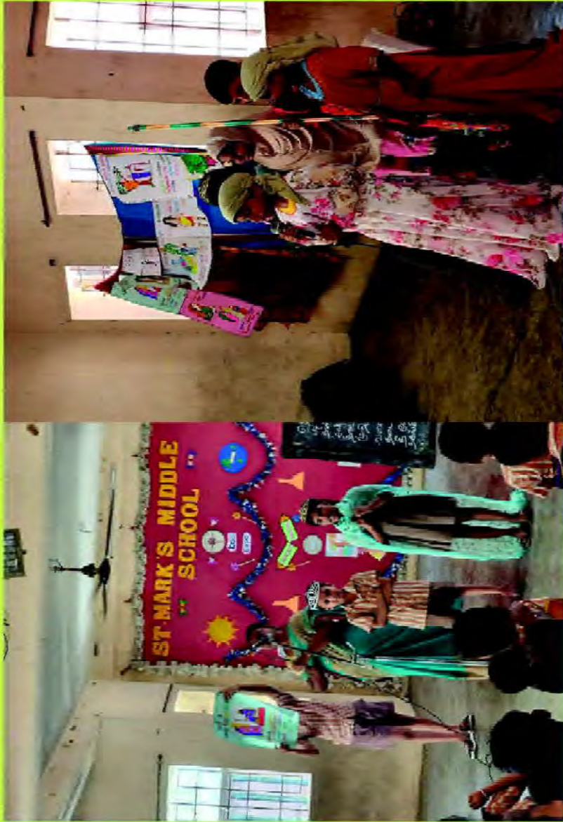
KSBS - St. Mark's School