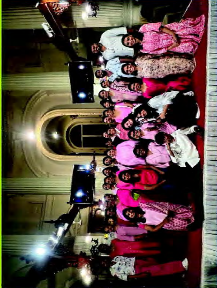
VBS : 24 Teachers & Volunteers