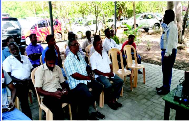
Drivers Fellowship meet on a Sunday