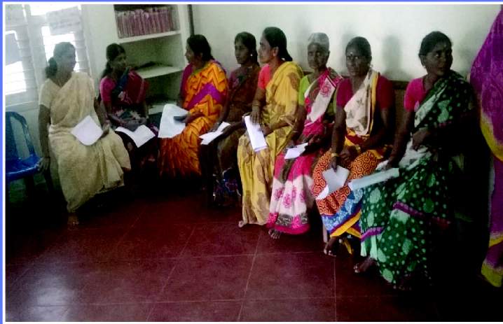
Patients at cancer screening camp - Karanodai - 23rd July.