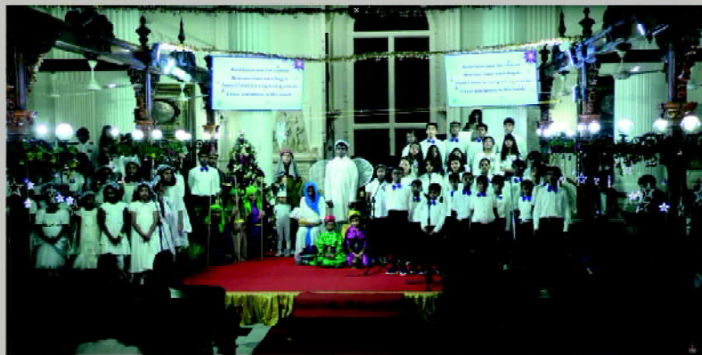
KSS Nativity Musical - Unto us a Child is Born by the Sunday school children