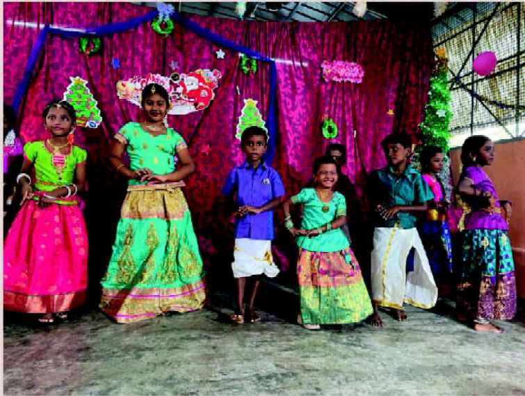
AKDCC Christmas Celebration