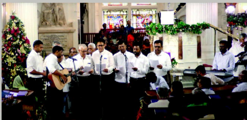
Men's Fellowship Sunday-Men in white presented a Christmas number