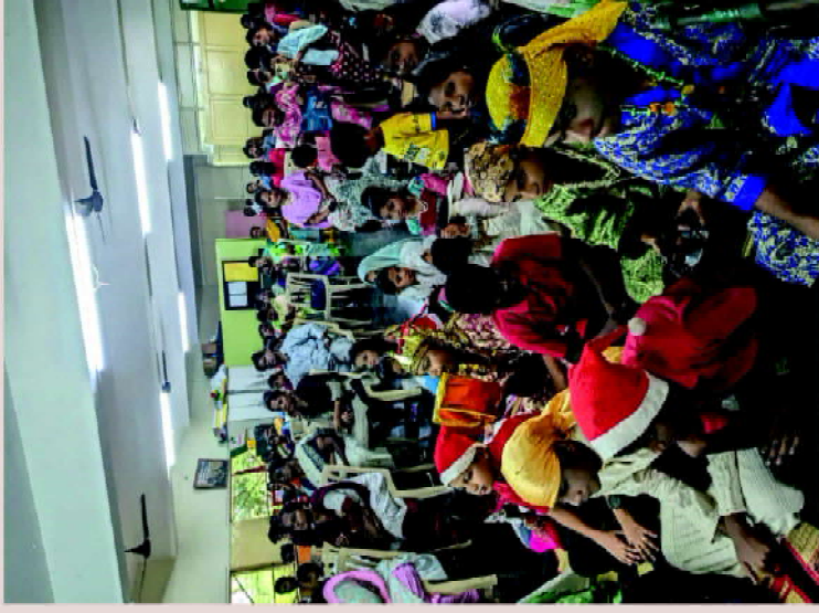
RMIDCC Christmas Celebration