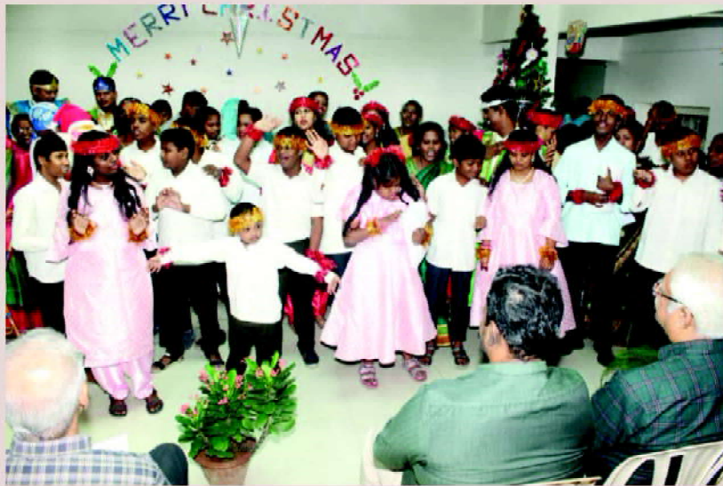
Asha Christmas Celebration