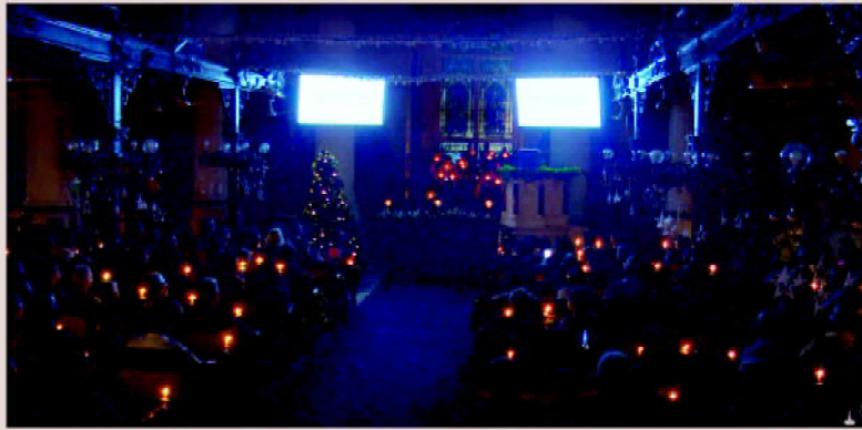
Christmas Carols Service