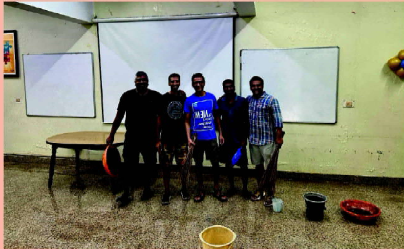
Clean up of SACCE Hall by Men's Fellowship volunteers post the recent floods