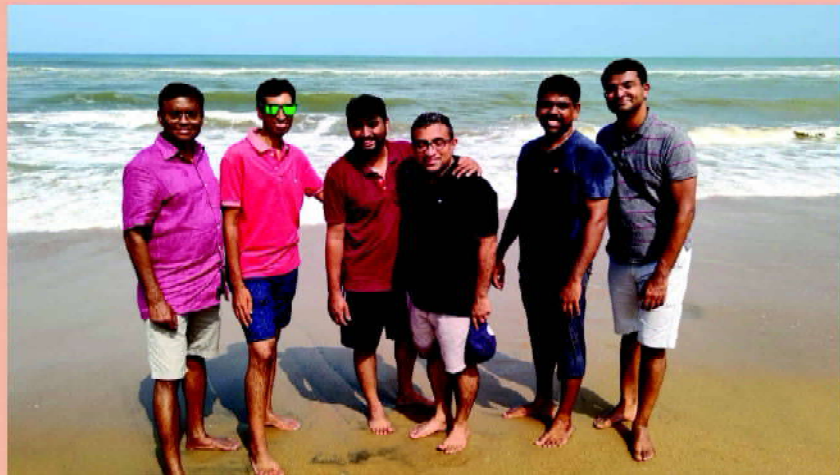
KMF Picnic at Mahabalipuram