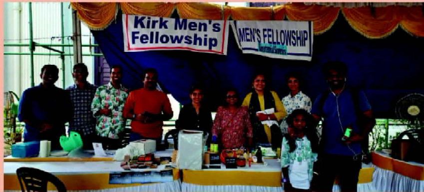
Kirk Men's Fellowship Stall at the Christmas Sharing Sale