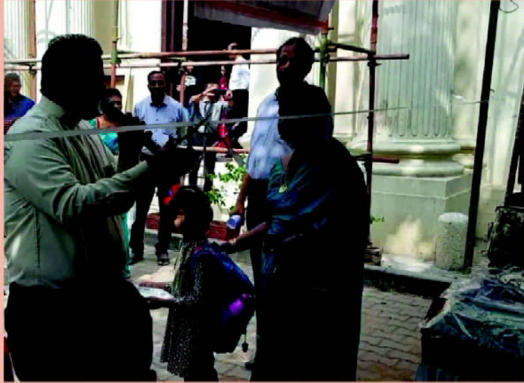
Christmas Sharing Sale 2023