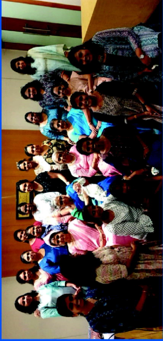
Perumabakkam Women's Fellowship