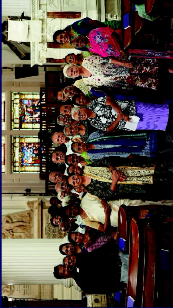
Friendship Club Members @ Kirk on 17.11.24