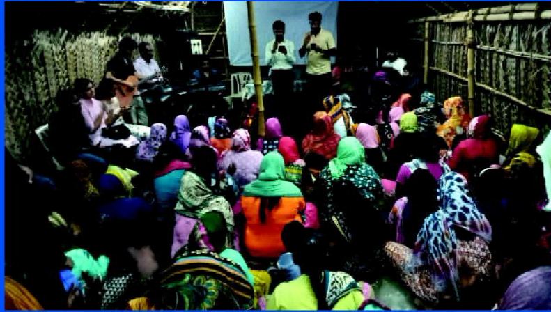
Ministry in Gypsy Colony, Pallavaram