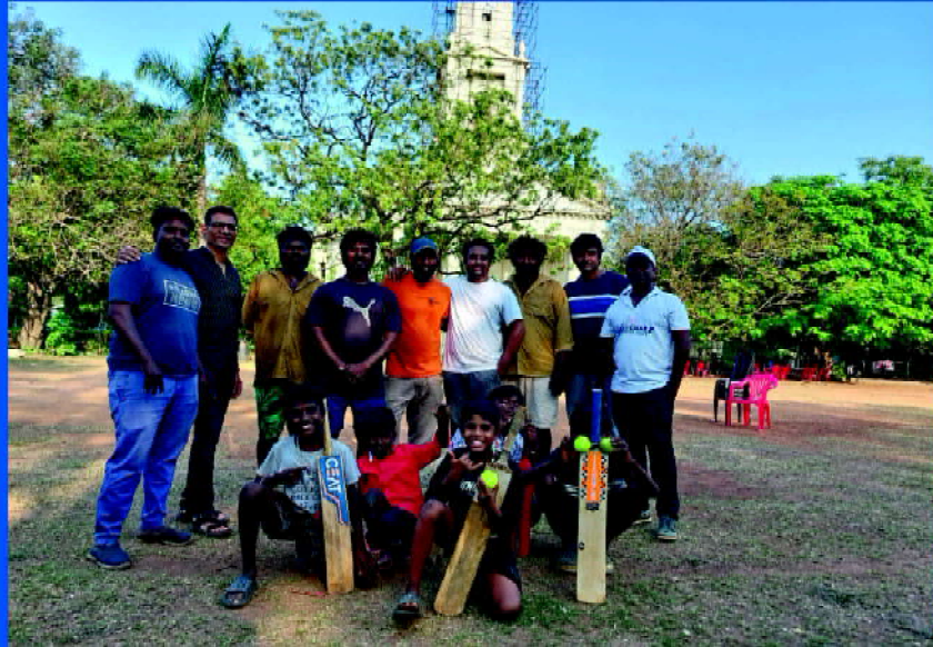
Urban Ministry Sports Fellowship trial meet in February 2024