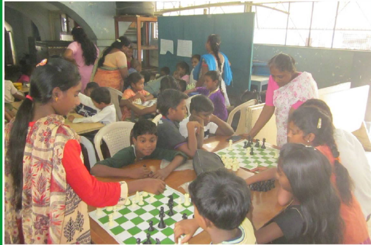
Chess class at AKCDC