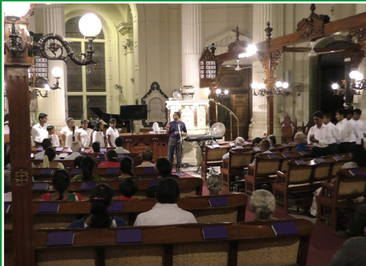
Piano recital by Young Musicians