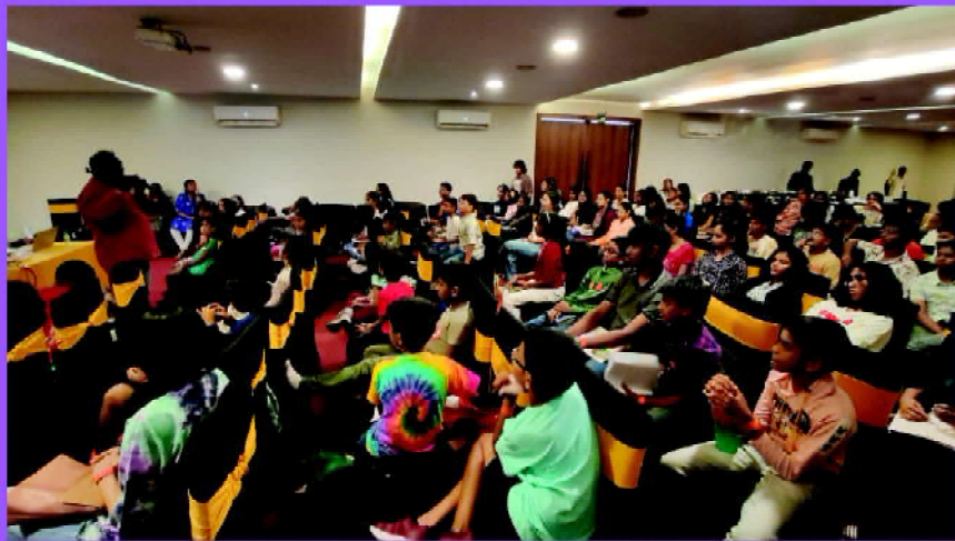
Kirk Sunday school Retreat