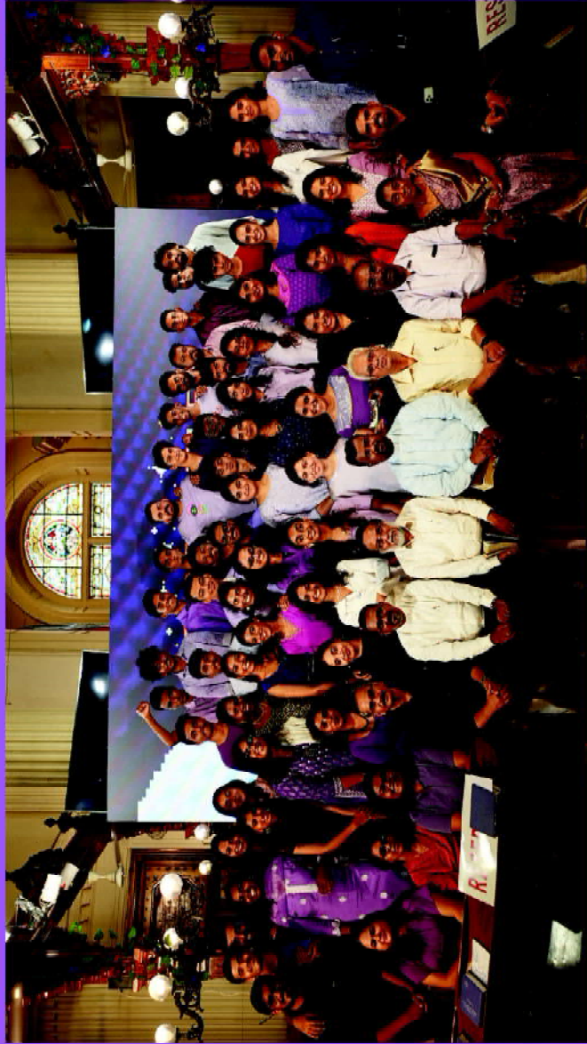
KYF Sunday - 28 July 2024