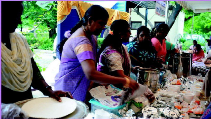
Asha Ministry Stall