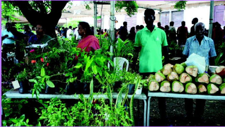
Produce from the Kirk Garden