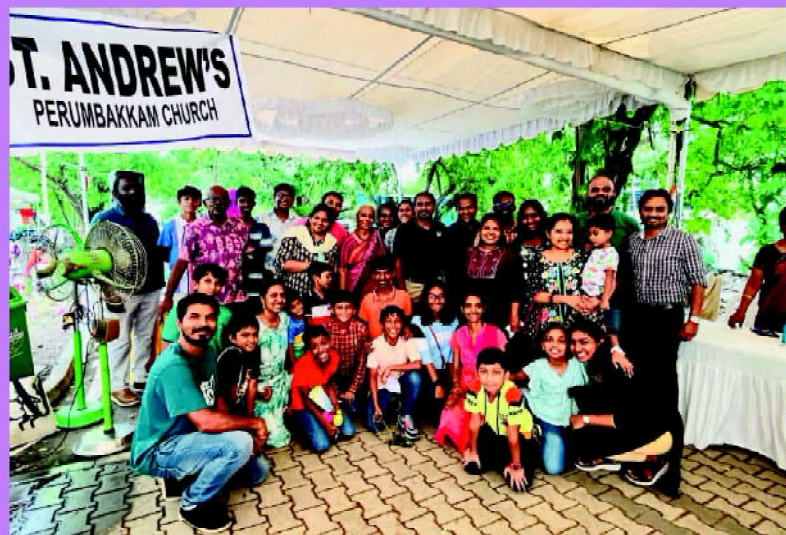
A team from the Kirk Women's Fellowship at one of their stalls.