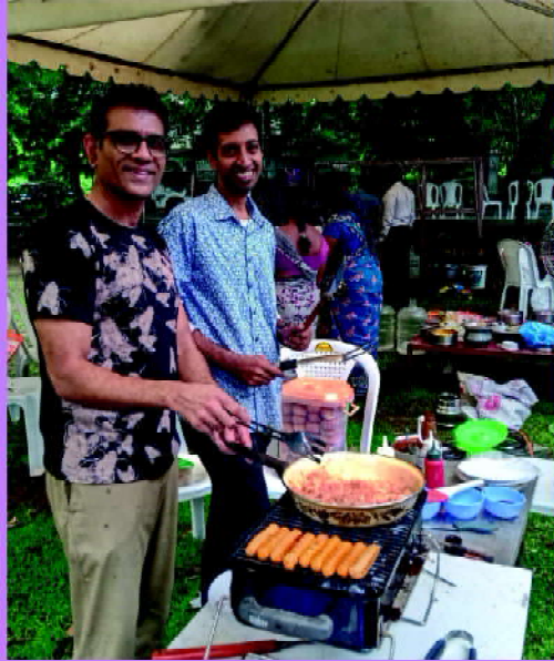
The congregation from the Perumbakkam Church at their stall.