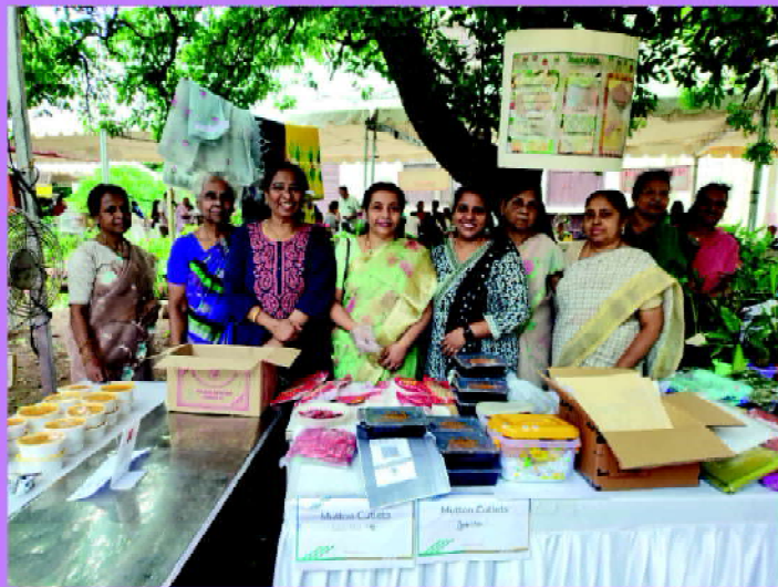
A team from the Kirk Garden Committee at their stall.