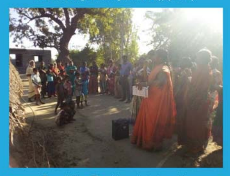
Poovami village (Tirupalaivanam) street preaching

45 : 08 August 2017 THE MAGAZINE OF ST. ANDREW'S CHURCH (THE KIRK), CHENNAI