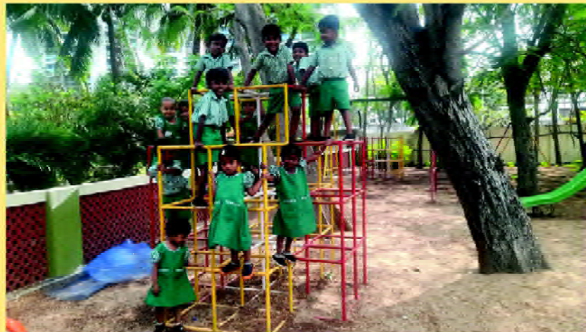
RMDCC Play Time