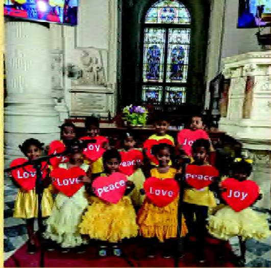
RDCC Kids Program