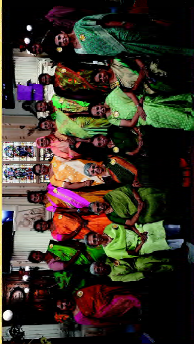
RMDCC Staff and Committee Members