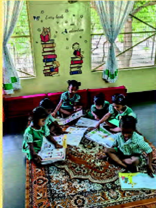
RMDCC Library Time