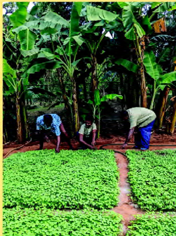
RMDCC ASHA Training