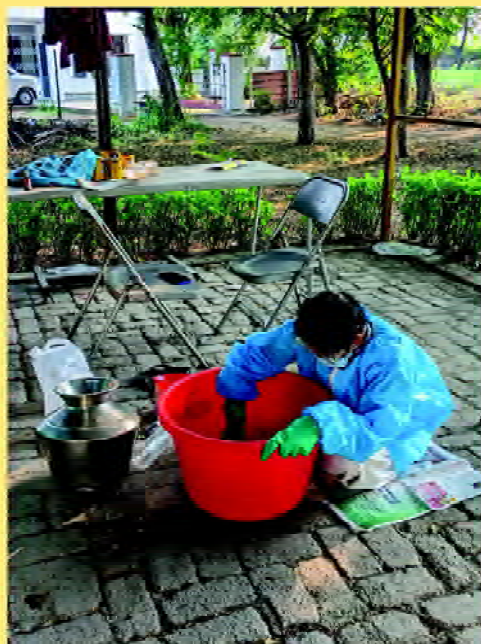
RMDCC Phenyl Making