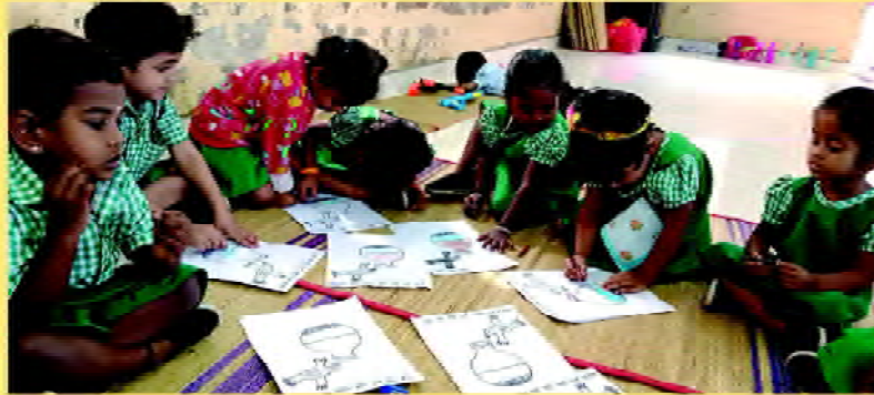
RMDCC Daily Activities