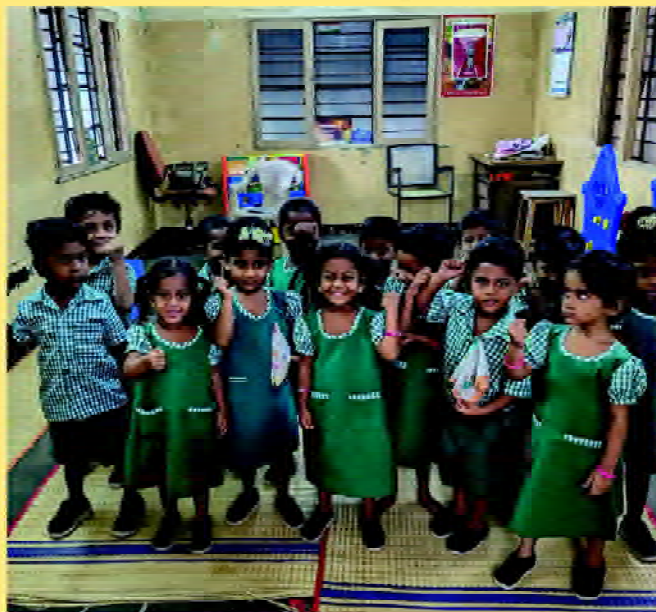
RDCC Joyful Singing