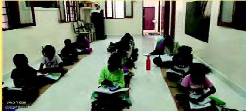
RMDCC Night School